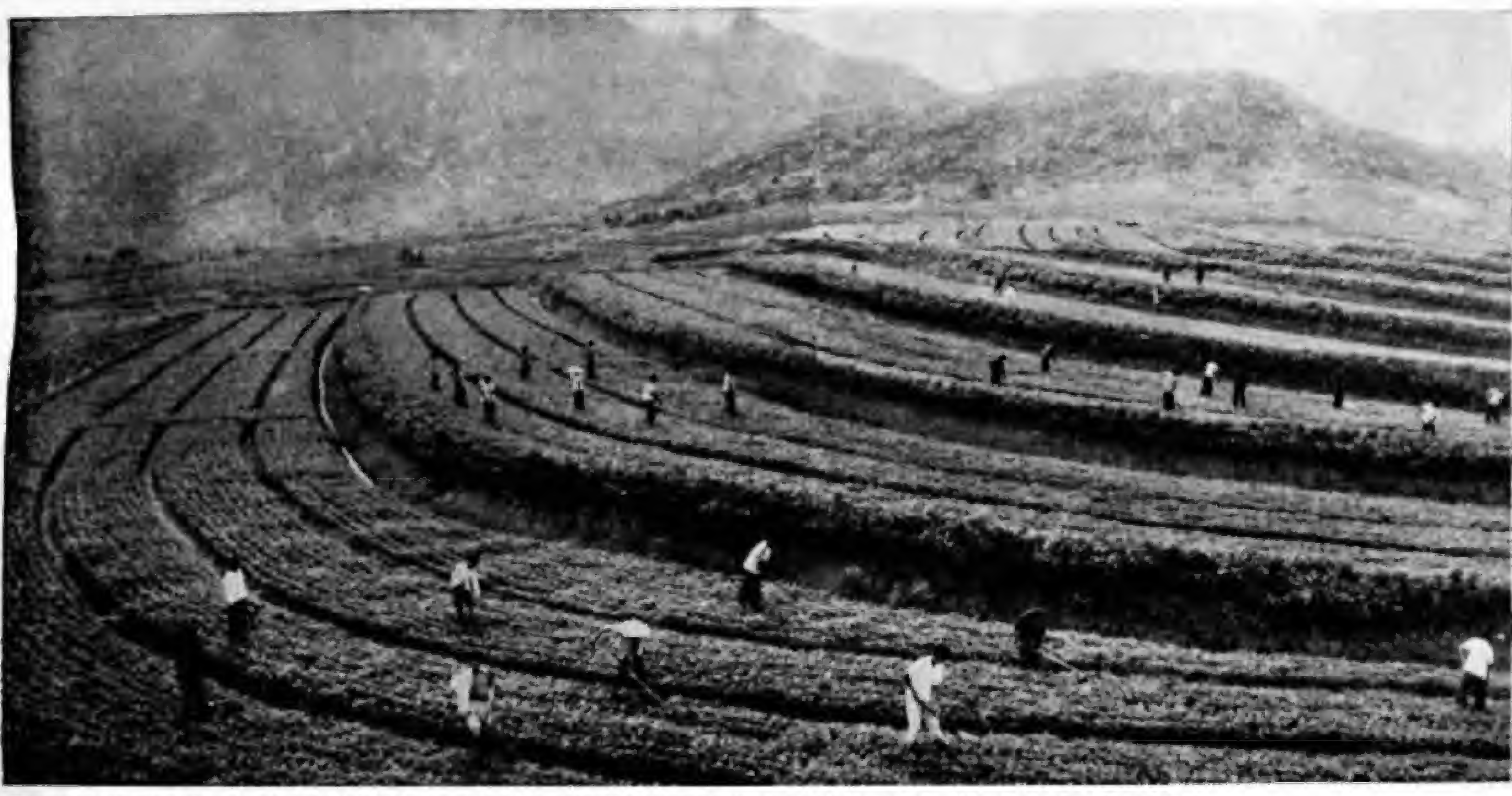
The once-barren slopes of the Lichiachai production brigade, now in fine level terraces under intensive farming.

Our people began to discuss the question. Many were of the opinion that the valley called Lungtan in the upper reaches of the Tashan River was an ideal site for a reservoir. Some of us had thought of this in the past, but the reason we had never carried it out was